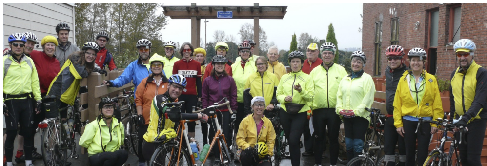
Sister Clubs Ride, Snohomish, October 9, 2010.