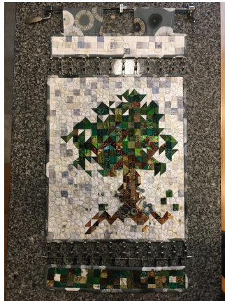
Velo Art Show