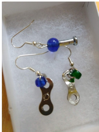
Velo Art Show